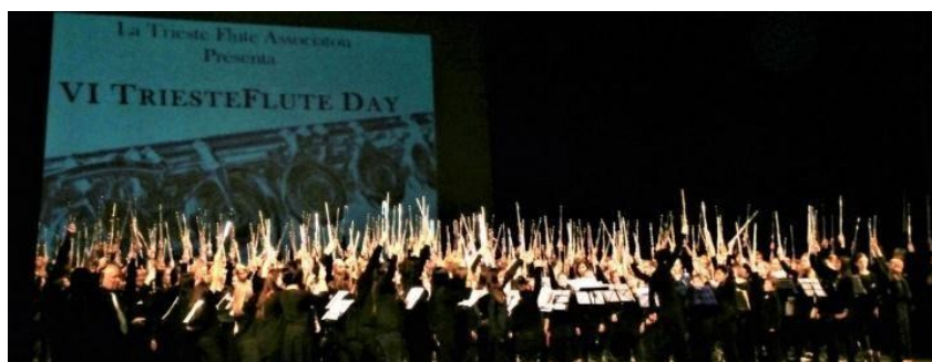
Rossetti Theatre Trieste, December 19, 2016