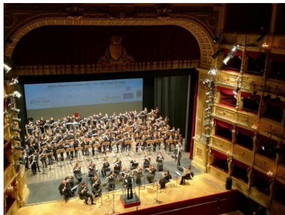
"G. Verdi" Theatre Trieste, December 10th, 2017